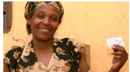
A family planning client in Wolatia Sodo, Ethiopia, who chose to have a contraceptive implant inserted holds up an informational card.

In 2017, Luxembourg’s funding support to UNFPA Supplies will help provide contraceptives with the potential to avert 52,000 unintended pregnancies, 140 maternal deaths, 900 child deaths and 16,000 unsafe abortions. This could save families and communities EUR 2.8 million in direct health care costs.