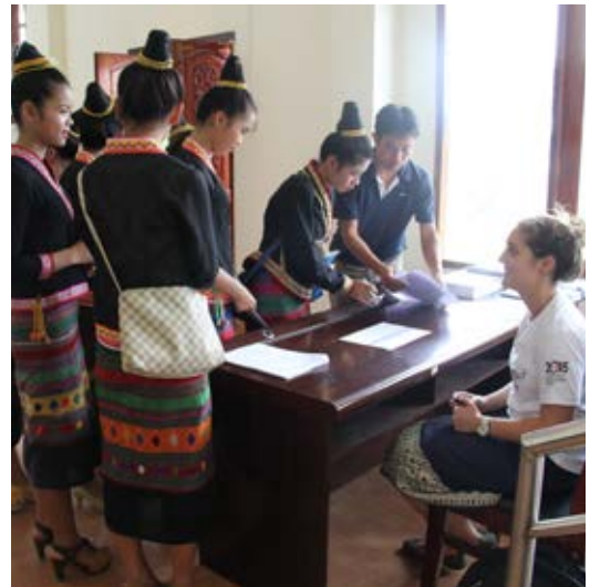
Young people celebrate International Youth Day in Luang Namtha, Lao PDR, 2016.

“Having the opportunity and privilege to work for the rights of a generation that will determine the outcome of all the SDGs and the way our world will look like tomorrow, is the most rewarding experience I can ask for.”