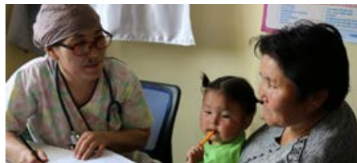
Partnership between Luxembourg and Mongolia supported the country in becoming one of only nine in the world to achieve MDG 5 to improve maternal health.

By 2019, when the project concludes, tele-consultation for maternal health services will be consolidated into Mongolia's national health system, ensuring sustainability in the long term.