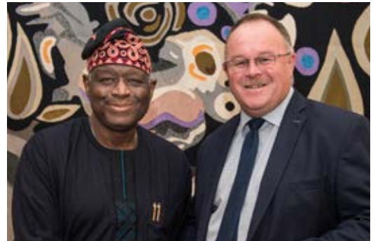
The late Dr. Babatunde Osotimehin, Executive Director of UNFPA, and Luxembourg's Minister of Cooperation and Humanitarian Action, Romain Schneider, at the SheDecides Conference.

In February 2017, Luxembourg's Minister of Cooperation and Humanitarian Action, Romain Schneider, participated in the She Decides conference, a global initiative in support of women and girls' fundamental rights. At the conference, Minister Schneider pledged an additional 2 million Euro in support to UNFPA (EUR 1.6 million for core resources and EUR 400,000 for UNFPA Supplies).