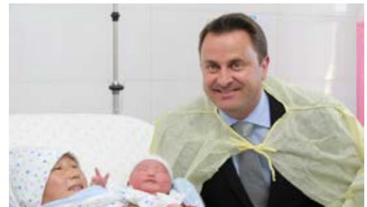
His Excellency Xavier Bettel, Prime Minister of Luxembourg, visits UNFPA's telemedicine project at the National Centre for Maternal and Child Health.