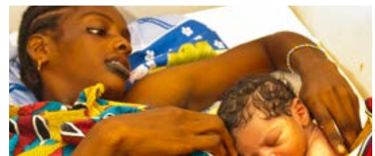
A young mother and newborn rest in Senegal's Richard Toll Hospital, a health facility supported by UNFPA.