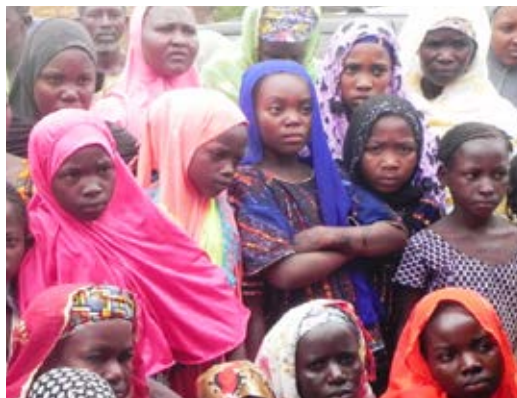
Adolescent girls participate in a community dialogue at their safe space in Yéni in Niger's Dosso region.

It is expected that implementation of the UNFPA-supported Adolescent Girls' Initiative and enforcement of the law will accelerate the reduction of child marriage in Niger.