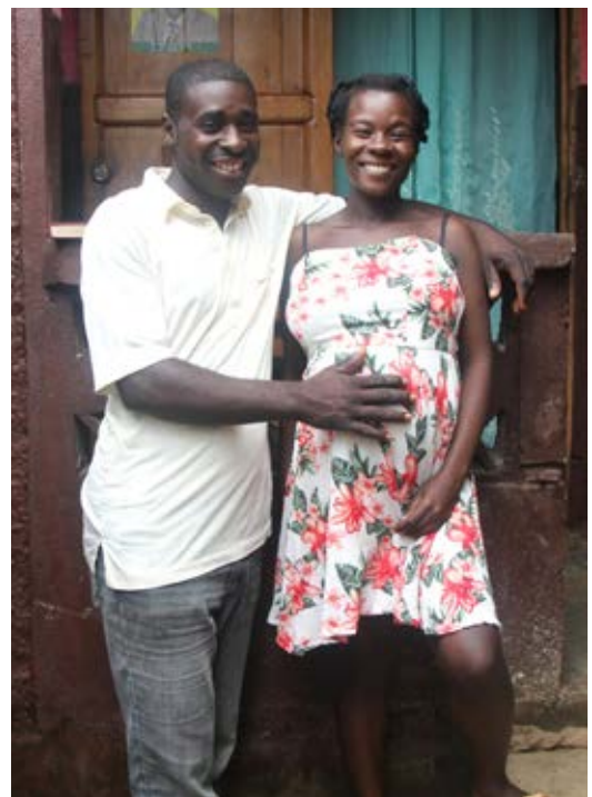
Couple in Haiti anticipates birth of their child. Couple seeks services for safe motherhood at health centre in Haiti.

© Nadia Todres, UNFPA Haiti, 2016. Photo submitted by Marielle Sander for the 2017 MHTF photo contest.